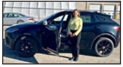
Dazed new E-Pace owner. The devil made me do it!

I spent the afternoon being shown all the gadgets and cool things. I was pleased that the ride on the 20" wheels was comfortable. Upon return from the drive, I said it was really a terrible shame that I couldn't afford such a nice car. Sitting in the office, we talked it around a bit and after a while and some polite conversation, the negotiations got down to a price I could afford—just barely. Voila! I had just bought my first new car in 19 years!