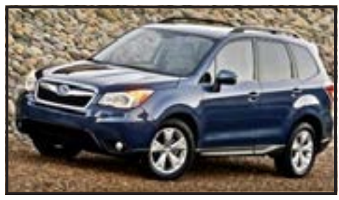
A 2014 Subaru Forester Limited

I then bought a 2014 Subaru Forester Limited. The cockpit was comfortably familiar and still offered large windows and a big sunroof.