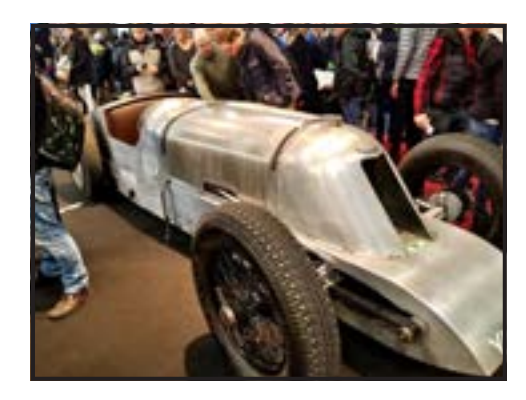
An Avions Voisin Race Car