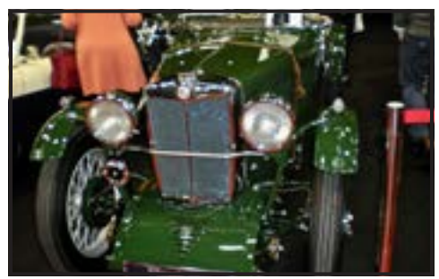
1933 MG J2 Midget

Serious buyers and classic car enthusiasts come to Retromobile either to add to their collection or to sell from their collection. One dealer told me that several million-dollar cars were sold on the first two days of the exhibition. But there were also many affordable cars for sale. The price for a 1933 MG Midget, was 72,000 euros.