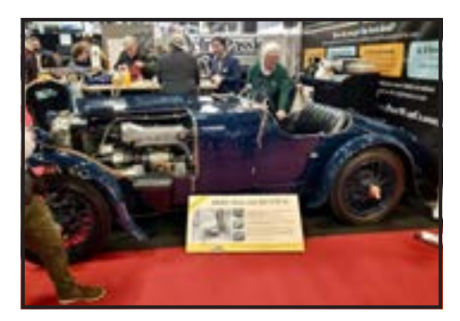
1928 Alvis 12/50 FWD

Lovers of British cars would not be disappointed in this year's Retromobile displays of British cars. A 1928 Alvis 12/50 FWD, the first car with front wheel drive, was parked alongside a display of Morgan roadsters. A 1954 Jaguar XK 120, in the original color, yellow green, was nearby.