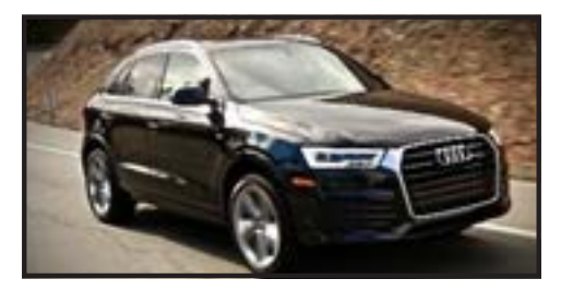
My short-lived 2016 Audi Q3 Prestige Quattro

So, I traded my faithful Forester for a 2016 Audi Q3 Prestige. The Audi was a beautiful car with some nice features, but had cramped driver ingress/ egress, intimidating electronics and unfriendly driver interfaces.