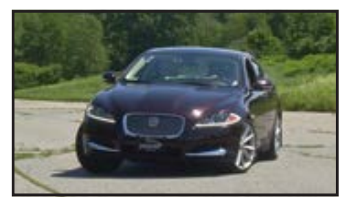
Paul Bicknell, showing what an XF can do.